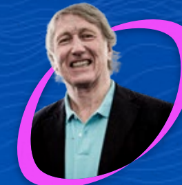
JPR WILLIAMS 2013