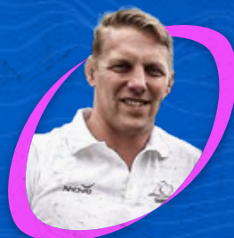
LEWIS MOODY 2019